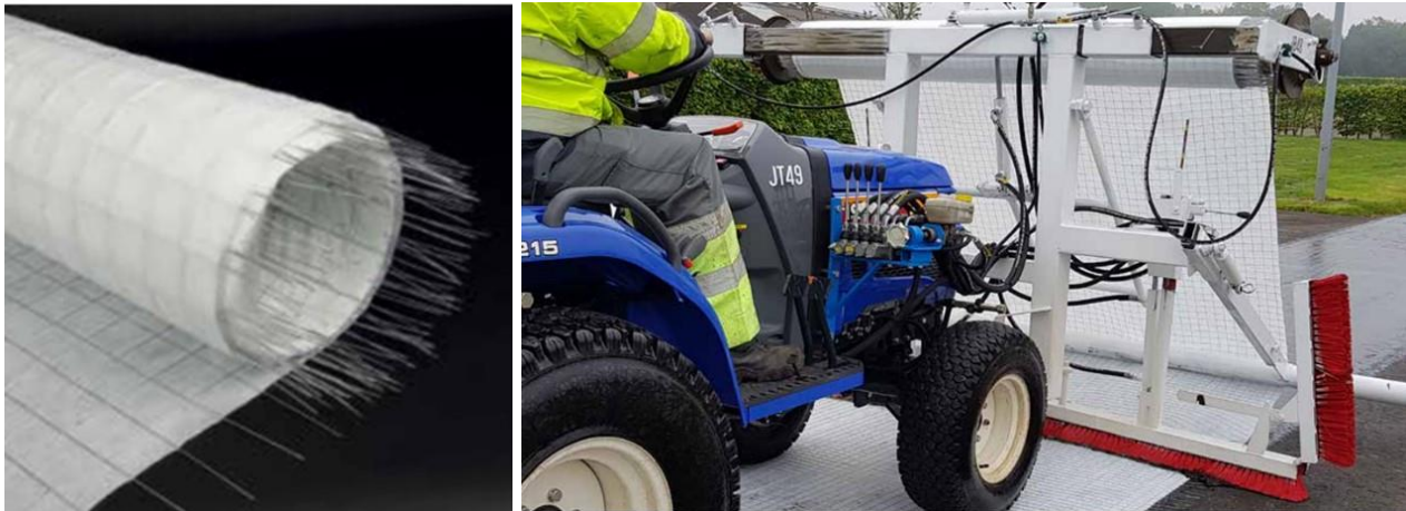
Figure 1. Fortifix® installation in a road structure

Bekaert ( www.bekaert.com ) is a global producer of steel wire reinforcement solutions for a wide range of applications. Fortifix® is a steel-based anti-reflective cracking interlayer solution covered by this EPD and is produced in the manufacturing plant located at Hlohovec, Slovakia. The mesh grid is built up from steel cords in longitudinal and cross direction, the steel cords are stitched to a carrier. Fortifix® 1-C & 2-C: with Closed carrier – PET non-woven (Fortifix® 1-C: highest steel density, Fortifix® 2-C: lowest steel density). The advanced steel cord structure is combined with a light-weight non-woven to provide optimal stability during the overlay process preventing rucking and pushing under site traffic. Figure 1 shows an application overview for Fortifix®.