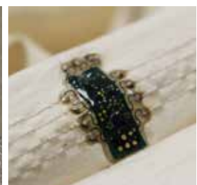
Flexible and stretchable conductors in multi-chip modules in electronic textiles