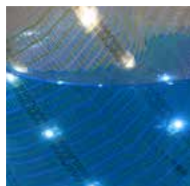
Waterproof insulated conductors and LED modules integrated into a scrim.

The test results show that our conductive yarns and cables can be reliably integrated into flexible materials. They will continue to perform well under severe conditions.