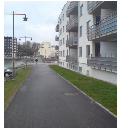
Picture showing typical balcony