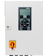
Control unit 18 or 32 kW and MonoCassettes NV with or without integrated fan and filter