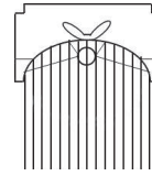
Parabolic reflectors: for a linear heat distribution