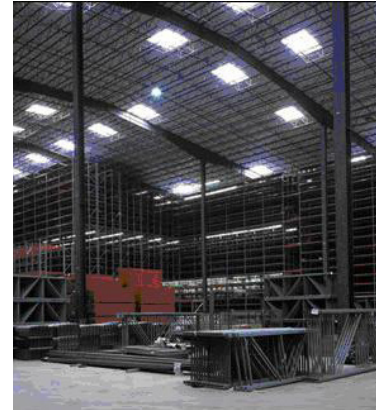
Racks and Mezzanines