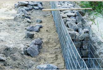
Bezinal®5000 Gabion wire solutions for river bank