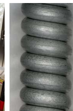
Bezinal® wires 80x magnifying ratio