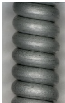
Bezinal® wires 50x magnifying ratio