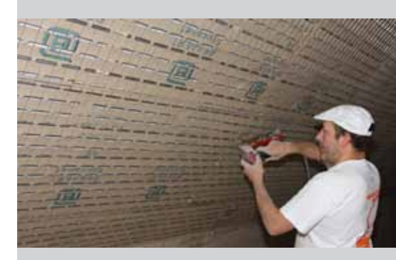
Quick and easy installation of Bekaert Stucanet® on wooden beams.

Stucanet® can be plastered and rendered both manually by hand application or mechanically using spray techniques. Typically, a total layer thickness of 20 mm is used. For more specific information please refer to the plaster or render manufacturers' recommendations.