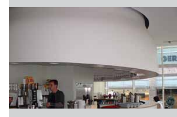
Cafebar, Wiesbaden, Germany