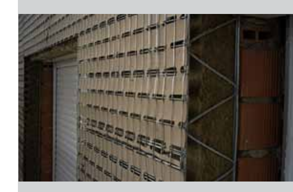
Bekaert Stucanet<sup>®</sup> as mortar support in a facade insulation system, mounted on metal Bekaert Poutrafil<sup>®</sup> profiles.