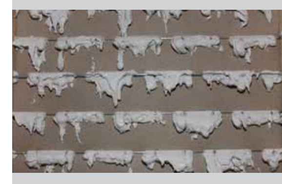
The bonding of the mortar around the steel wires ensures firm anchoring.

It offers better protection against tears and cracks in facade and exterior plasterwork in general.