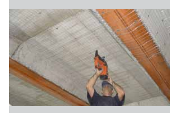
Mounting of Bekaert Stucanet® on a concrete substrate.