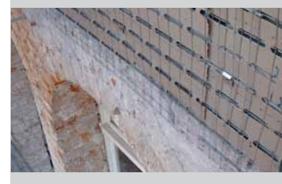
Bekaert Stucanet® applied in a facade renovation project with exterior plasterwork.