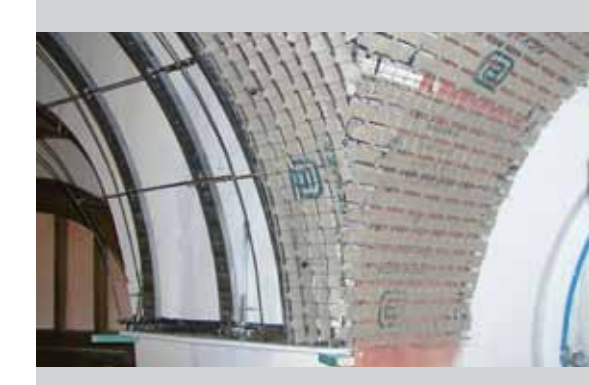
Bekaert Stucanet<sup>®</sup> panels are extremely flexible and easy to install on metal profiles.