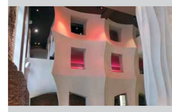
East-Hotel, Hamburg, Germany

Stucanet® opens up new architectural and artistic finishing options for both interior and exterior plasterwork and rendering. It gives the designer or architect total freedom in the creation of individual designs both in residential and non-residential applications (e.g. restaurants, hotels). Stucanet® has also repeatedly proved to be the ideal solution for building highly inventive creations as part of the construction of recreational parks.