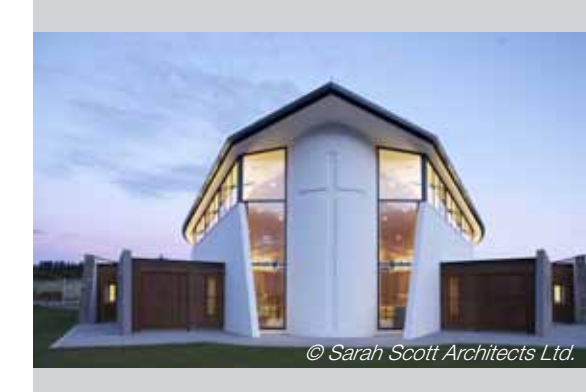
Holy Family Catholic Church, Wanaka, New Zealand