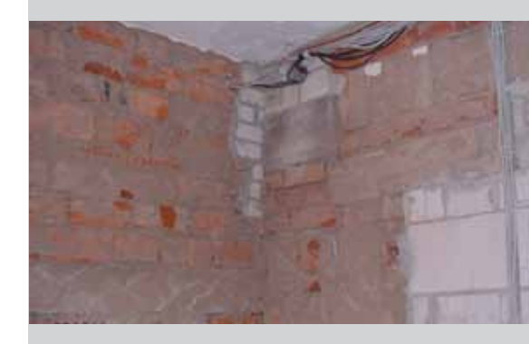
The substrate in renovation projects often consists of a mix of different building materials. Bekaert Stucanet<sup>®</sup> allows the durable renovation and plastering of this type of difficult walls.