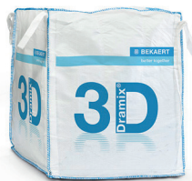
BIG BAG 800 - 1.100 kg