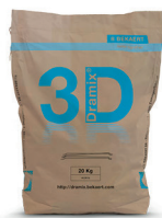
BAGS 20 kg